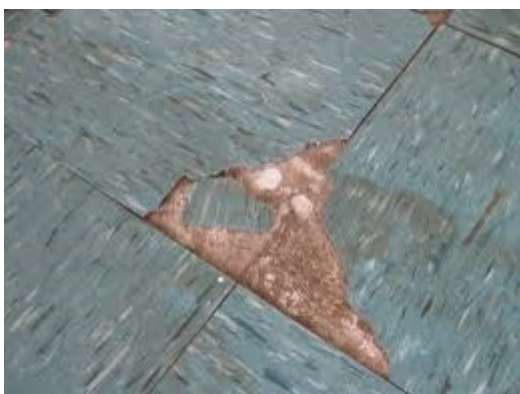
Asbestos floor tiles

For further images of ACMs, you can go on the HSE website: