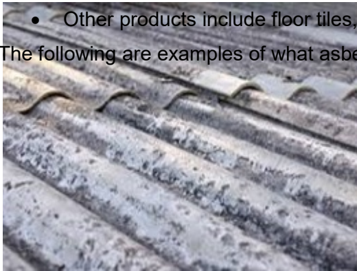
Asbestos cement roof

The following are examples of what asbestos might look like: